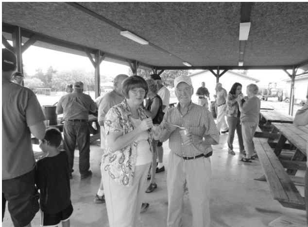
Some of the "tasters" at the 2013 Greenback Historical Society Ice Cream Contest.