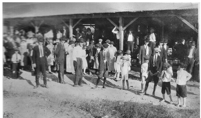
The crowd on the last Sunday of the National Campground Tabernacle Meeting in 1923.