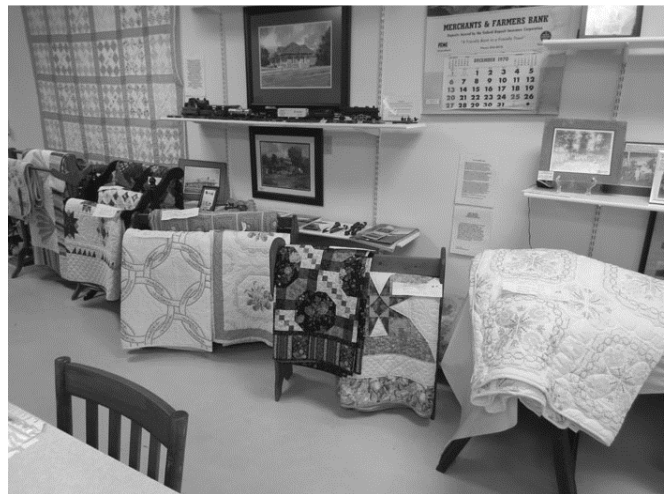
A few of the quilts on display at this year's show at the Greenback Heritage Museum.